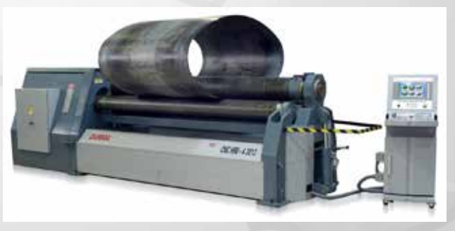
HRB-4 CNC Control System