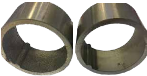
Disabled Spatter Protection